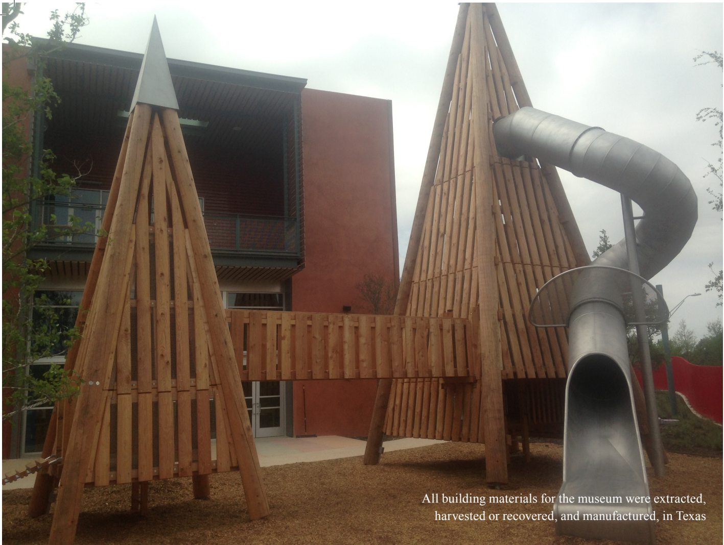
All building materials for the museum were extracted, harvested or recovered, and manufactured, in Texas